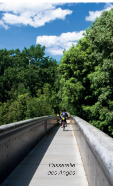
Passerelle des Anges